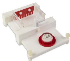
Figure 4 MS7-FC